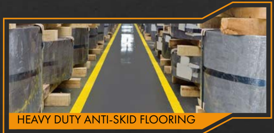
HEAVY DUTY ANTI-SKID FLOORING